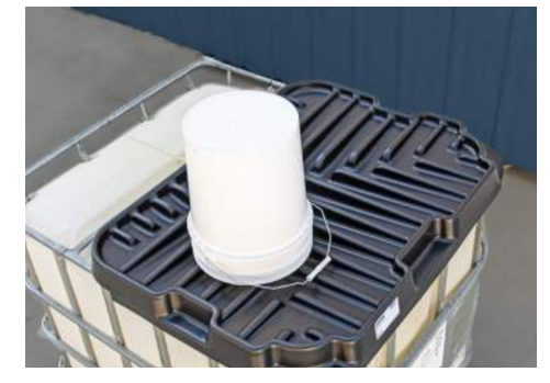
Containers can be placed on top for passive draining