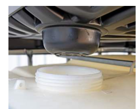
Drain with built-in strainer fits directly into top of IBC