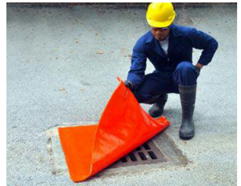
Ultra-Drain Seal helps seal off drains to minimize problems!

* Will cause the Ultra-Drain Seal™ to swell temporarily but not degrade.