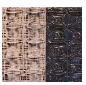
Turf Reinforced Mats (TRM)